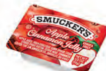
Apple Cinnamon Jelly 5150001923