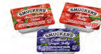
Assortment #8 Grape/Strawberry/Apple 5150001696