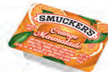
Orange Marmalade 5150000766