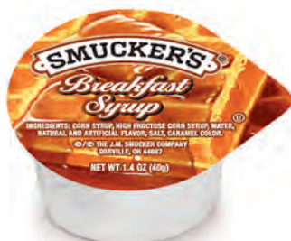
1.4oz Breakfast Syrup 5150002283 100ct