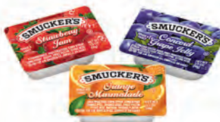
Assortment #5 Grape/Strawberry/ Orange Marmalade 5150000800