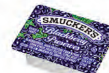
3/4oz Blackberry Preserves 5150002108