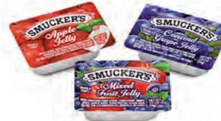
Assortment #1 Grape/Apple/Mixed Fruit 5150000773