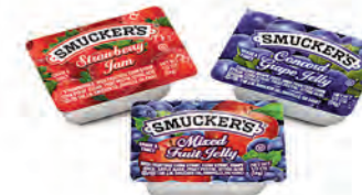
Assortment #4 Grape/Strawberry/Mixed Fruit 5150000774