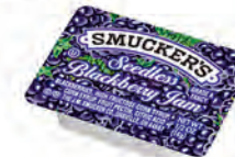
Seedless Blackberry Jam 5150001698