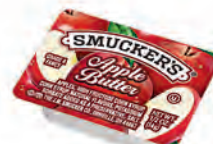
Apple Butter 5150001984