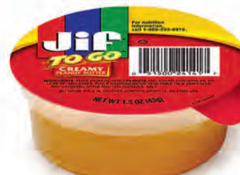
1.5oz Jif to Go® Creamy Peanut Butter 36ct: 5150024114 96ct: 5150024170