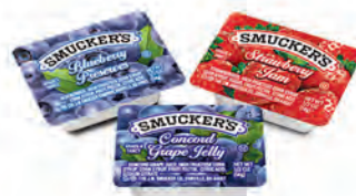
Assortment #16 Blueberry/Strawberry/ Grape 5150000768