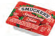
Strawberry Jam 5150000767