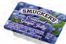
Grape Jelly 5150000764