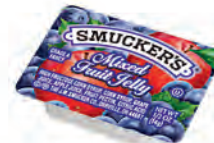
Mixed Fruit Jelly 5150000765