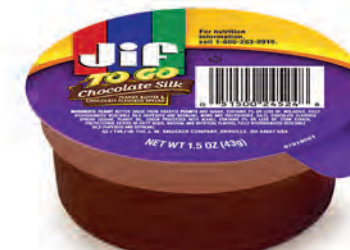
1.5oz Jif to Go® Chocolate Silk Peanut Butter 8ct 6pk: 5150024112

For complete product information, please visit our website: www.smuckerfoodservice.com