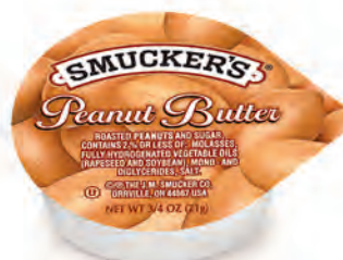
3/4oz Peanut Butter 5150002282 200ct