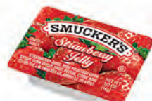
Strawberry Jelly 5150001717