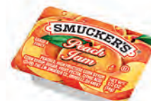
Peach Jam 5150002189