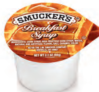
2.1oz Breakfast Syrup 5150002284 100ct