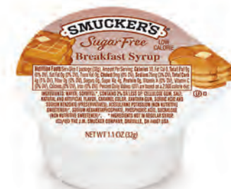
1.1oz Sugar Free Breakfast Syrup 5150002277 100ct