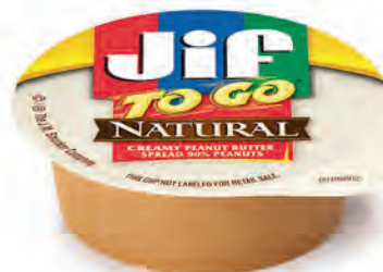
1.5oz Jif to Go® Natural 96ct: 5150021889