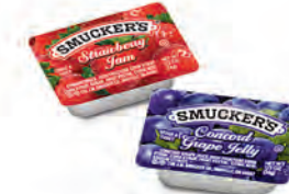
Assortment #3 Grape/Strawberry 5150000795