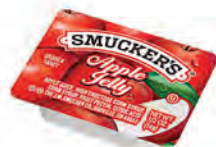
Apple Jelly 5150000760