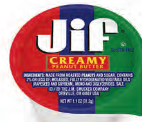
1.1oz Jif® Creamy Peanut Butter 5150092100 120ct