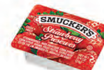
3/4oz Strawberry Preserves 5150002106