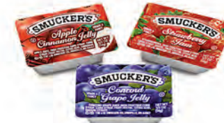
Assortment #7 Grape/Strawberry/ Apple Cinnamon 5150001691