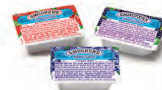
3/8oz Sugar Free Assortment Grape/Strawberry/Blackberry 5150005555