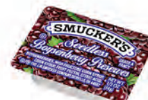
Seedless Boysenberry Preserves 5150002890