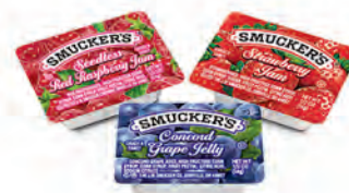
Assortment #17 Raspberry/Strawberry/ Grape 5150000770