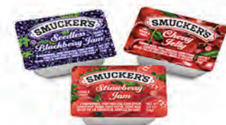
Assortment #6 Strawberry/Cherry/ Blackberry 5150001140